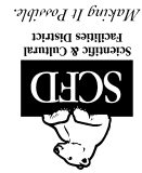
Exhibit coming Spring 2005... 'A Sporting Good Time!'