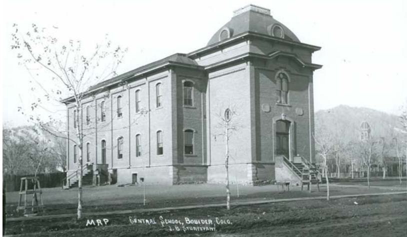
Central School at 15 th between Walnut and Canyon (1884-1891) with the original cupola and after the west addition was built.

of the present Boulder Valley district. The razing of Central, to be replaced by the present U.S. National Bank building and more recently an office building on Walnut Street, was a major impetus for the formation of Boulder's other preservation organization – Historic Boulder.