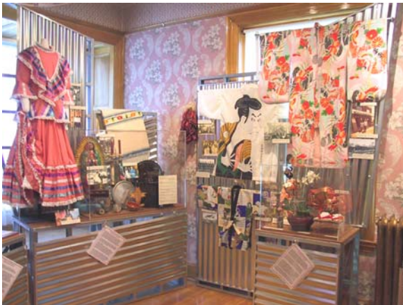
Left: Come & visit our latest exhibit 'Opening Doors, Opening Eyes' now through January 2005.