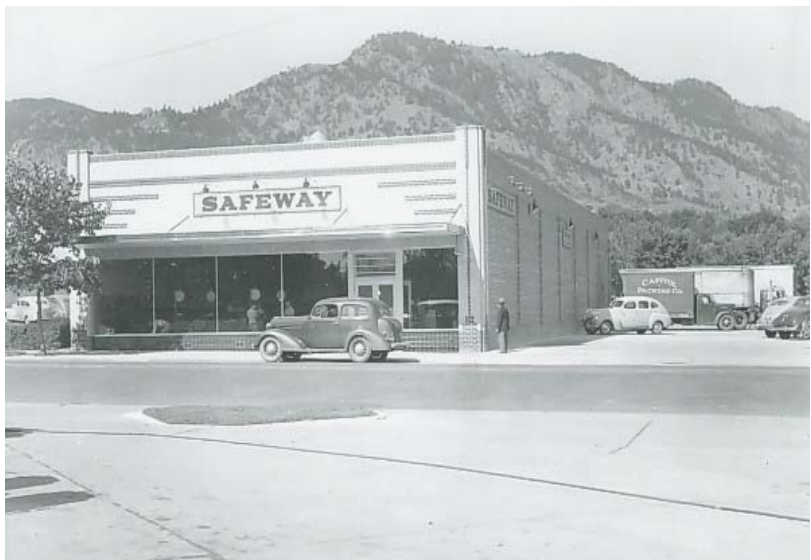
Safeway store at Arapaho and Broadway, 1940s

The museum went first, followed by the library, etc. etc. Ultimately, too, there was no resemblance between the buildings proposed in 1945 and the one actually started in 1951. Meanwhile, beginning in 1949, the Boulder School district made half of the second floor of the Central School building available to the society. Selected artifacts and pictures then owned by the society were displayed. In 1952, the rest of the top floor was made available. This museum was