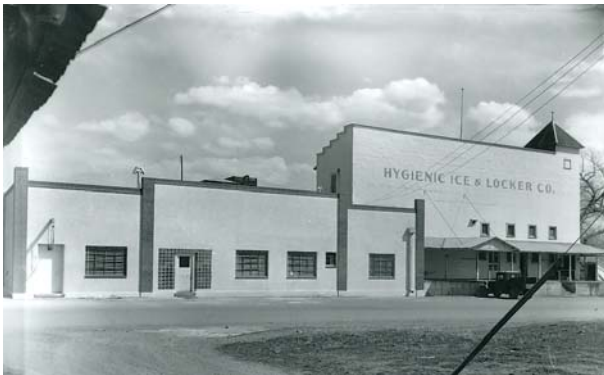
Hygienic Ice & Locker Co. renamed the Boulder Ice and Cold Storage Company in 1955 destroyed by fire in 1958.

Colorado had a "Rush to the Rockies" celebration in 1959, which