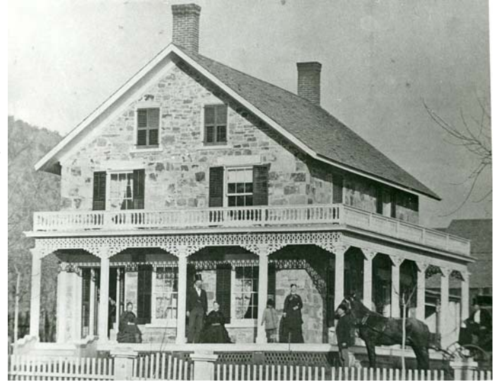
Squires-Tourtellot-Malick house at 1019 Spruce St., circa 1865.

By 1976, when Colorado celebrated the centennial of statehood, the society not only had the Pioneer Museum free of debt, but also was able to acquire the Squires-Tourtellot-